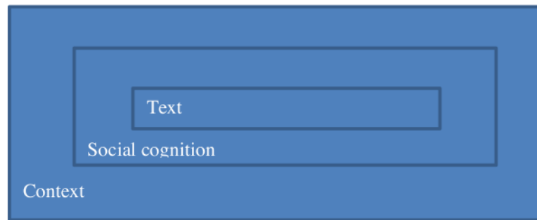
Figure 2. Van Dijk Discourse Structure Analysis