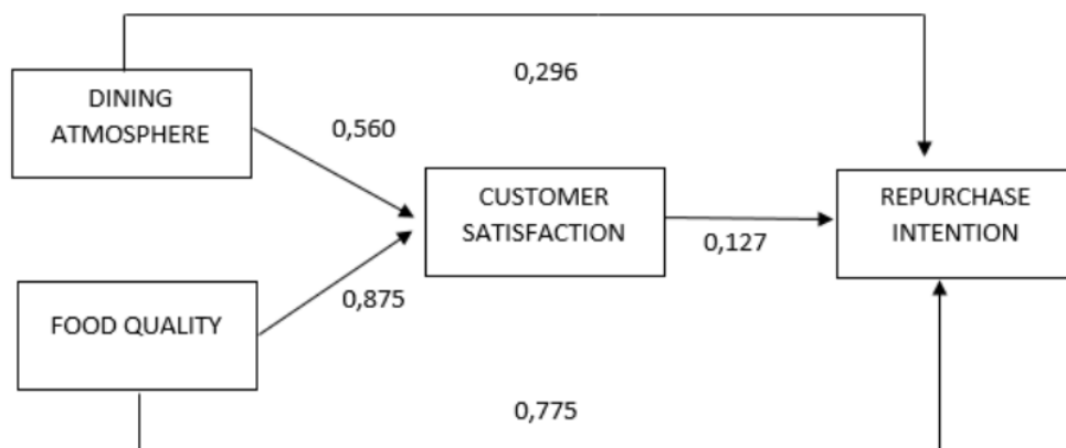
Figure 2. Research result