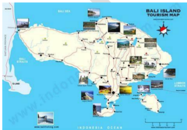
Figure 1. Tourist site of Bali

Bali Province consists of Bali Island and small islands with an area of 563,286 Ha or 0.29% of the total area of the Indonesian archipelago. The small islands are Nusa Penida Island, Nusa Ceningan Island, Nusa Lembongan Island, Serangan Island in the south facing the Indian Ocean and Menjangan Island in the northern hemisphere of Bali Island facing the Java Sea. Figure 1 shown the tourist sites of Bali.