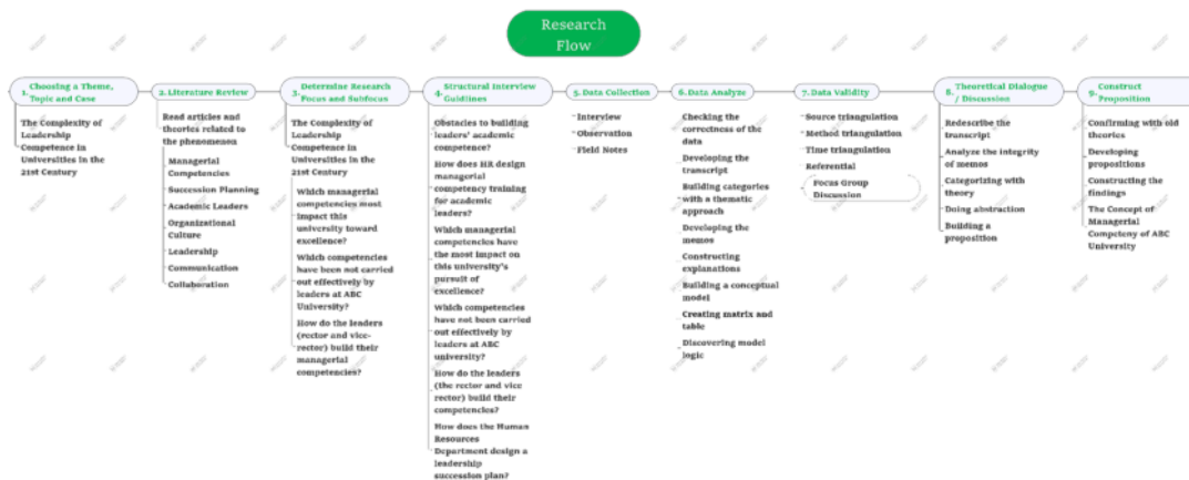
Picture 1. Research Flow