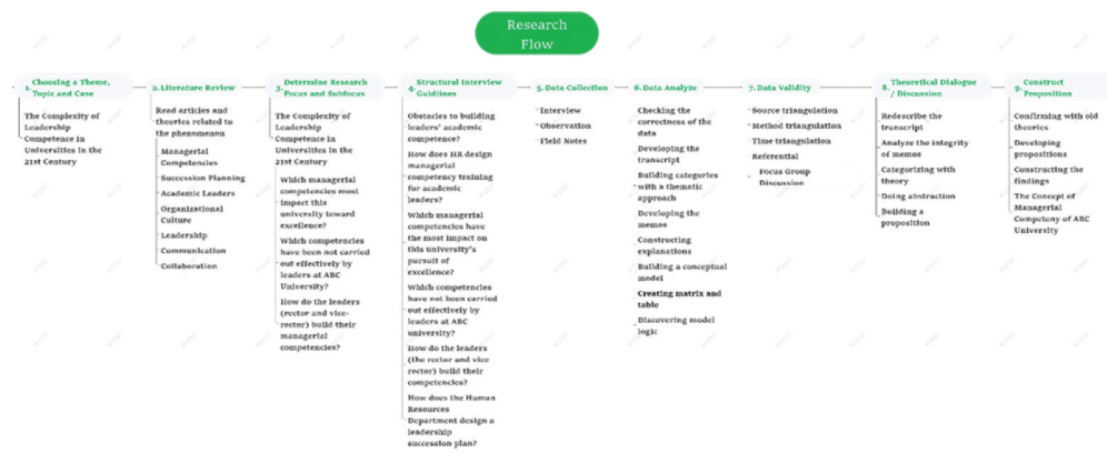
Figure 1. Research procedures and stages

The research procedure in Figure 1 explains the conceptual framework and research stages covering the research period. These stages include: 1) identifying problems related to leadership