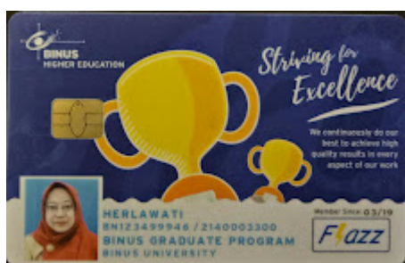
ID CARD STUDENT-HERLAWATI-PAPER160.jpg 209K