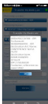
BUKTI BAYAR ICCED2019-PAPER160.jpg 64K