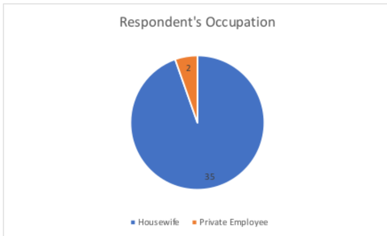
Fig. 2. Respondents' occupation in renzo edupark UBJ Cibadak Sukabumi

Numeracy refers to a person's ability to understand, use, and work with numbers and mathematics in a variety of contexts. It includes basic skills such as counting, measuring, solving math problems, and understanding concepts such as ratios, percentages, and probability. Numeracy is also important in managing personal finances, making decisions involving numerical data, and participating in various aspects of economic and business life. Numeracy skills help individuals become more independent in managing financial matters, measuring risks, and making data-based decisions. The numeracy skill of Renzo Edupark UBJ Cibadak Sukabumi based on the test of numeracy skill with the result as below: