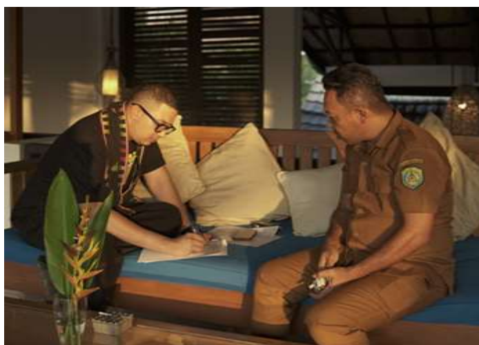
Figure 4 In-Depth Interview Process

This methodology allows for a deeper understanding of the lived experiences of informants, facilitating insights into their perspectives and the meanings they ascribe to their experiences. By utilizing this approach, the research aims to capture the nuances and complexities of the subjects' experiences, contributing to a richer analysis of the social transformation and welfare in Labuan Bajo.