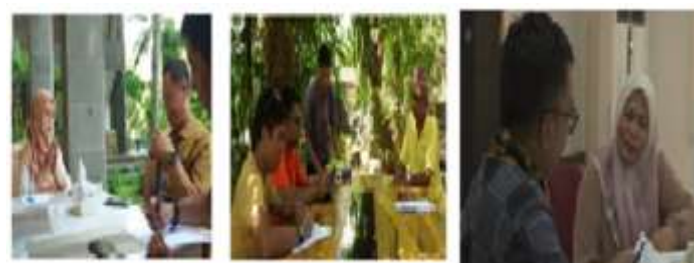
Figure 5 Phenomenological Stages with In-Depth Interviews of Informants