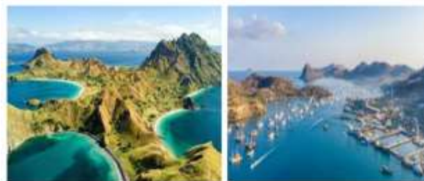
Figure 1 Scenic View of the Islands in Labuan Bajo

from outside East Nusa Tenggara. Economic difficulties are also reflected in the BPS survey results, which indicate that many living conditions are still inadequate, with the majority dominated by materials such as zinc, bamboo, wood, straw, palm fibers, and only a small portion made of concrete with tiles and asbestos. In fact, household consumption and expenditures, as well as living conditions, are indicators of family welfare.