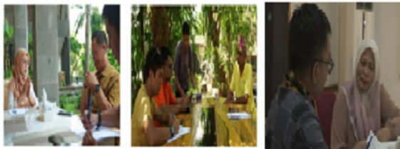
Figure 5 Phenomenological Stages with In-Depth Interviews of Informants