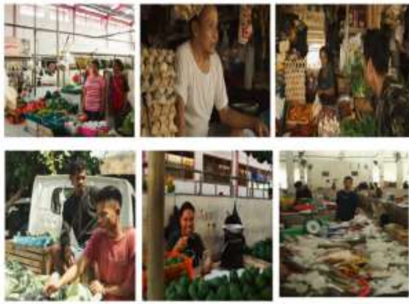
Figure 2 Observation and Q&A at Kosambi Market, Old Market, and Fish Auction Site

Social capital plays a crucial role in encouraging the community to innovate in pursuit of welfare, as evidenced by their sense of togetherness in engaging in joint ventures, exchanging ideas and skills, and collaboratively providing electricity using solar power, especially in remote areas. However, these innovations remain local and have not yet fully enabled the community to achieve prosperity; external support, particularly from local and central governments, is necessary. The driving force behind the innovations undertaken by the people of Labuan Bajo stems from their social capital, fueled by their motivation to complement each other's shortcomings. This motivation serves as a catalyst for the community to turn the challenges they face into collective opportunities for growth. Based on this background, the author conducts research to assess the extent to which social transformation impacts the welfare of the community in Labuan Bajo, East Nusa Tenggara.