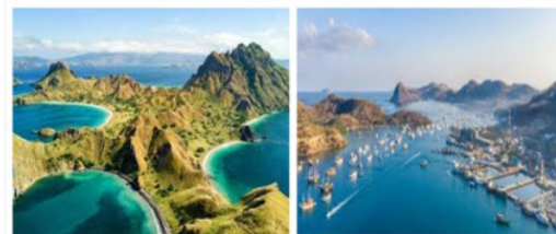
Figure 1 Scenic View of the Islands in Labuan Bajo

from outside East Nusa Tenggara. Economic difficulties are also reflected in the BPS survey results, which indicate that many living conditions are still inadequate, with the majority dominated by materials such as zinc, bamboo, wood, straw, palm fibers, and only a small portion made of concrete with tiles and asbestos. In fact, household consumption and expenditures, as well as living conditions, are indicators of family welfare.