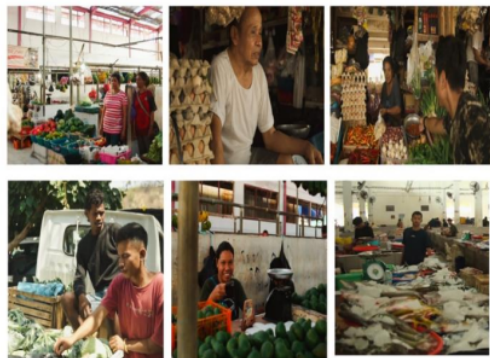
Figure 2 Observation and Q&A at Kosambi Market, Old Market, and Fish Auction Site

1 Social capital plays a crucial role in encouraging the community to innovate in pursuit of welfare, as evidenced by their sense of togetherness in engaging in joint ventures, exchanging ideas and skills, and collaboratively providing electricity using solar power, especially in remote areas. However, these innovations remain local and have not yet fully enabled the community to achieve prosperity; external support, particularly from local and central governments, is necessary. The driving force behind the innovations undertaken by the people of Labuan Bajo stems from their social capital, fueled by their motivation to complement each other's shortcomings. This motivation serves as a catalyst for the community to turn the challenges they face into collective opportunities for growth. Based on this background, the author conducts research 1 to assess the extent to which social transformation impacts the welfare of the community in Labuan Bajo, East Nusa Tenggara.