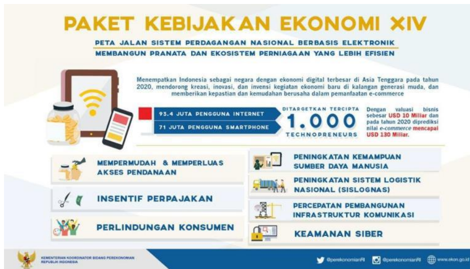
Figure 1. Economic Policy Package XIV in Indonesia

Basically, P2P Lending system is very similar to the concept marketplace on line , Which provides a platform as a meeting place between the buyer and the seller. P2P Lending has officially regulated by the Financial Services Authority (FSA) through FSA regulation number 77 / POJK.01 / 2016 , Until December 2018, according to data from the FSA Lending Fintech there are 78 companies already licensed and