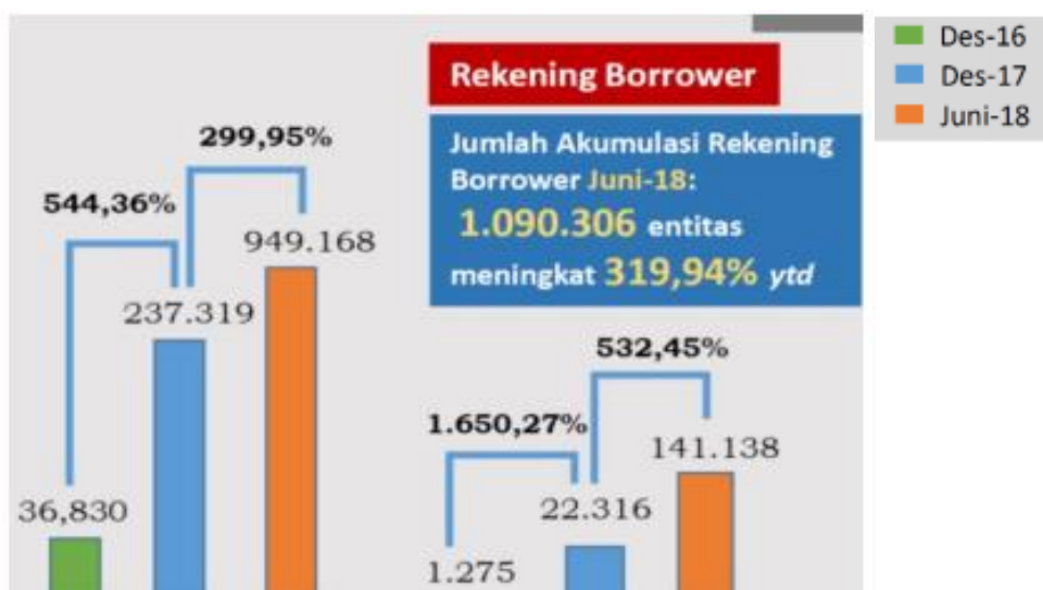
Figure 3. Borrower account P2P Lending

* Source: Group Financial Innovation Digital and Micro Finance FSA