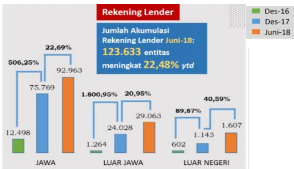
Figure 2. Lenders account P2P Lending

registered. Fintech development of P2P Lending in Indonesia practically very rapidly, as evidenced by the accumulation of the amount of borrowing up to June 2018 amounted to 7.64 trillion, an increase of 197.80% from a year ago. Here are some developments P2P Lending sector released by the Group Financial Innovation Digital and Micro Finance FSA in 2018 are: