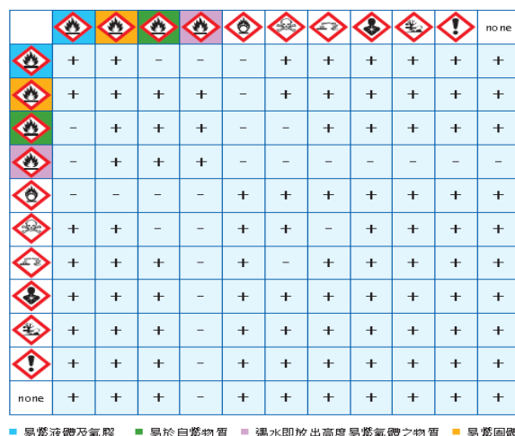
Figure 3 Merck China mapping chemical.

After finding the highest hazard or the hazard that should be prioritized for each material, arrange the materials in the available places, namely 2 material cupboards and 1 letter L long shelf of material concerning the Merck China table which has hazard signs. The materials can be placed side by side or cannot be placed side by side. Merck tables can be seen in Figure 3.